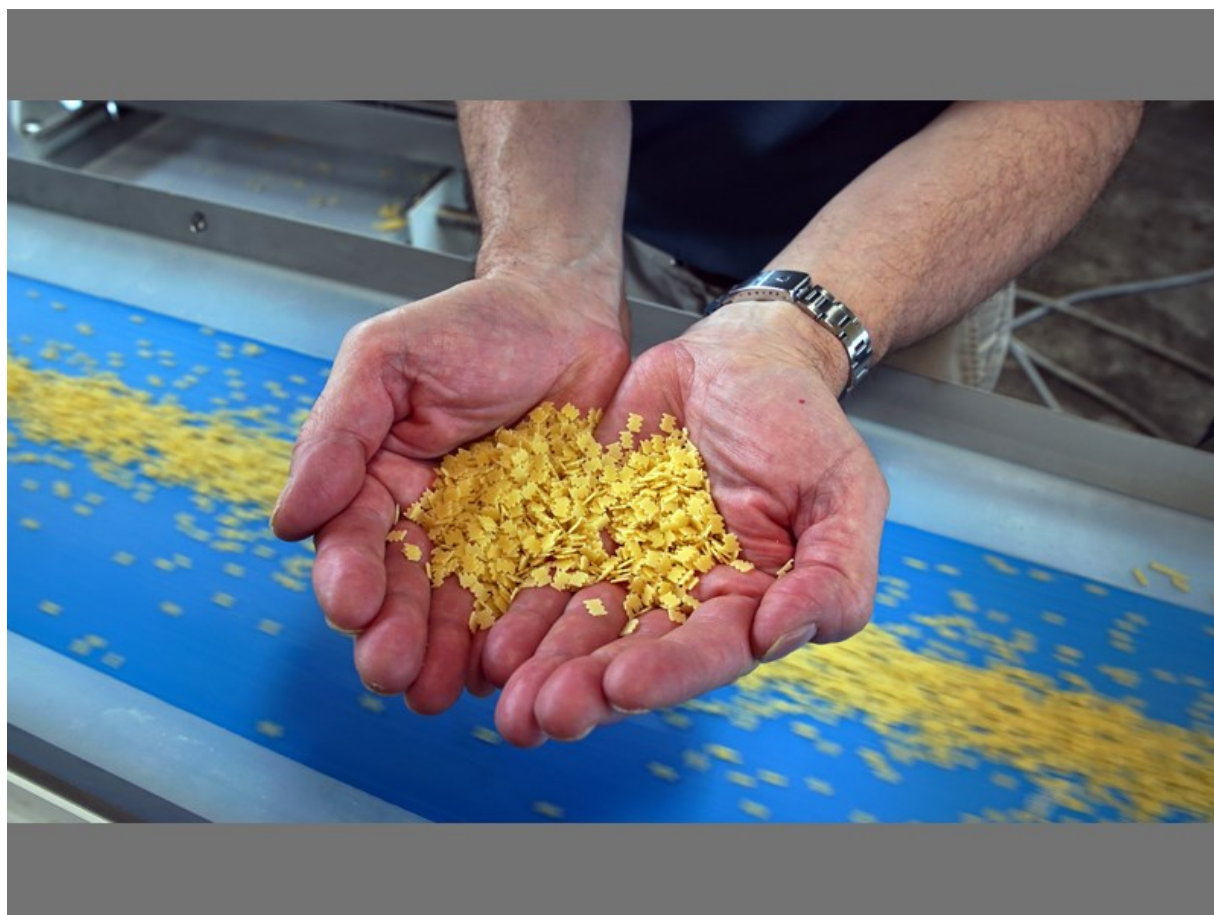
■ Detail of quadrucci