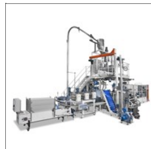
Quadrucci forming machine on short pasta line