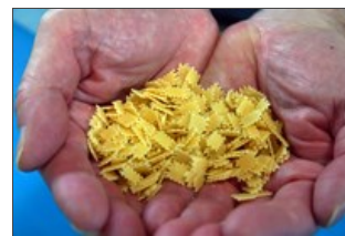
Quadrucci forming machine - detail