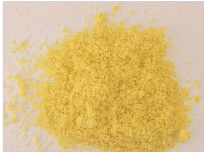
■ Uniformly ground product