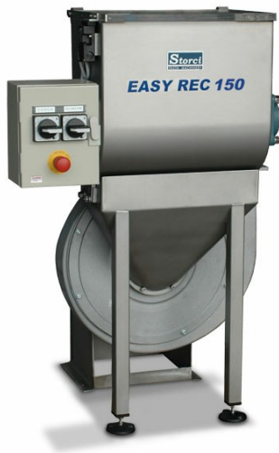
■ Easy Rec