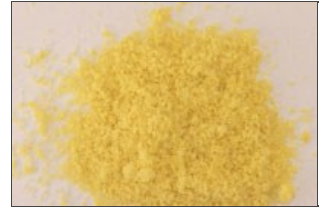
Uniformly ground product