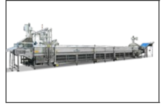
Cooker with rods CR-36.4

Cookers CCT series are the best solution for continuously cooking the dough in ready-meals lines. They guarantee uniformity of cooking , attention to transport operation and in-out phases of the product. These cookers are suitable for treating any dough dimensions and enable several cooking times.