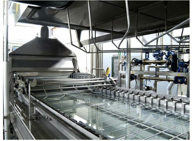
■ Cooker with rods - detail