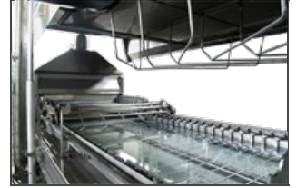
Cooker with rods - detail