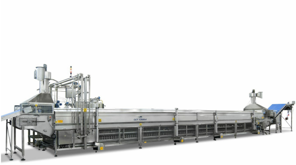
■ Cooker with rods