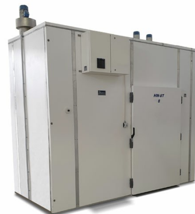
HW static dryers