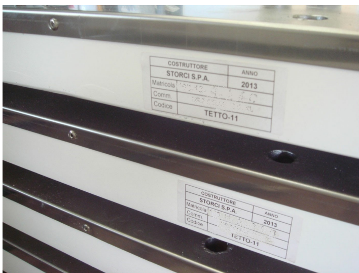
Detail of panels