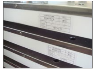
Detail of panels