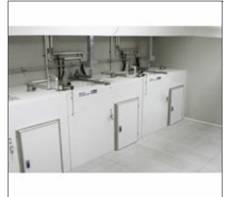
4 and 3 trolley static dryers (not standard model)