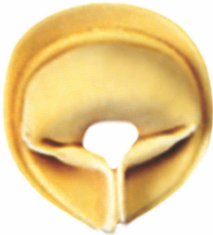
■ Cappelletto pinzato