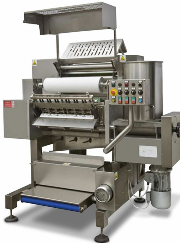
R 540 C