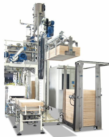
■ Robo XI tray stacker