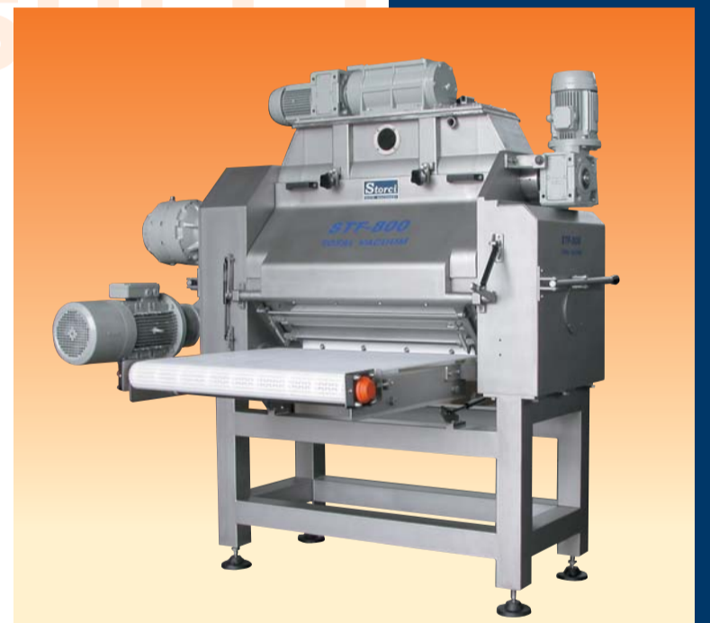
STF-800 TOTAL VACUUM

A revolution is happening in the field of pasta production machines, in particular in the sheeter machines sector. The STF Total Vacuum® is one of the more interesting novelties on the market, a machine that is unique in the world. During the Ipak Ima 2003, the STF Total Vacuum was the real protagonist, by capturing most of the visitors interest. With this machine, Storci has shown their growth in technological research, by applying it to machines that have already amply demonstrated to have extraordinary characteristics. Indeed, the STF Total Vacuum® , in addition to possessing all the exceptional qualities of the STF sheeting machine, such as total mechanical reliability, highest pasta quality and superior ease of cleaning, produces a pasta sheet in absence of air. What does this mean? It means obtaining a product of more intense yellow colour, better elasticity, this aspect being particularly important when coupled to forming machines, a more compact dough and an excellent cooking retaining quality, the latter particularly appreciated in the production of laminated pasta. In the forecoming months, Storci will apply the same technological advance to the VSF series sheeter machines in the sizes between 250 and 540 mm, thus allowing many producers to adopt the Total Vacuum technology at a moderate cost.