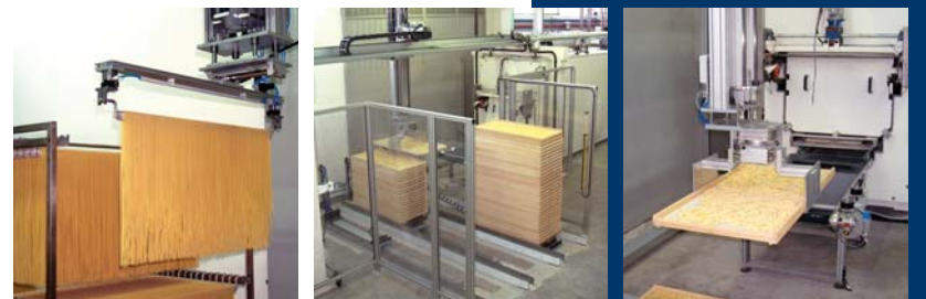
OMNIROBO installed at the Rustichella D'Abruzzo plant