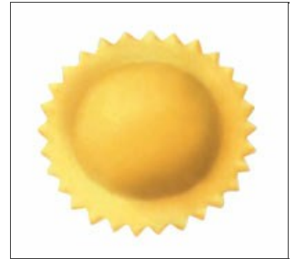
Double sheet round ravioli