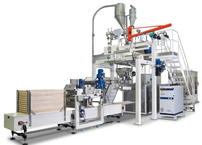
Special line for nested pasta, lasagna, short-cut pasta and special pasta